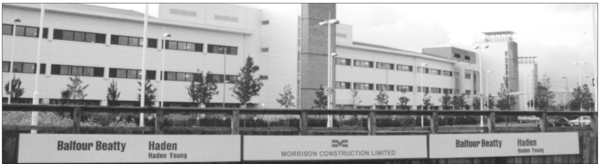
Like sponsors' boards round a football pitch, the names of the PFI profiteers are proudly displayed around the new £180m Edinburgh Royal Infirmary, which will cost the taxpayer £900m.